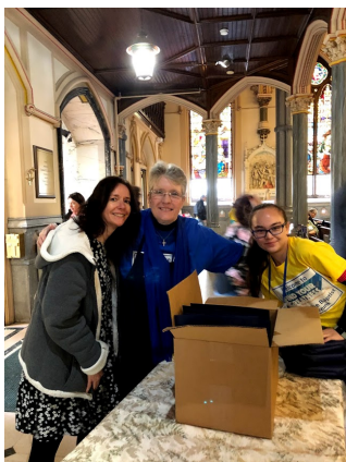
Parish Volunteers at Find Your Greatness