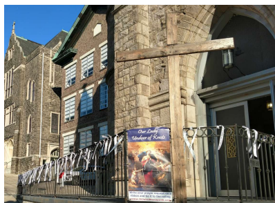
Our Lady Undoer of Knots Prayer Ribbons