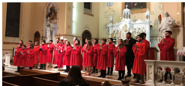
2020 PREP Confirmandi, November 4, 2020 at Holy Family

Thanks to so many parishioners, St John's is a growing and vibrant parish, and we'd like very much for your assistance to continue this growth and development. We offer a variety of options and opportunities for you and your family to participate in the work and mission of the church. We'd love to see many more children and adults get involved. If you have ideas for additional ministries, please let us know. Please consider where and how your gifts, talents and/or resources could contribute to our pastoral goals and reach out to anyone on the pastoral council to raise your hand.